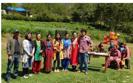
The team of the Montessori Centre.

With suitable materials, the children learn playfully and develop their talents.