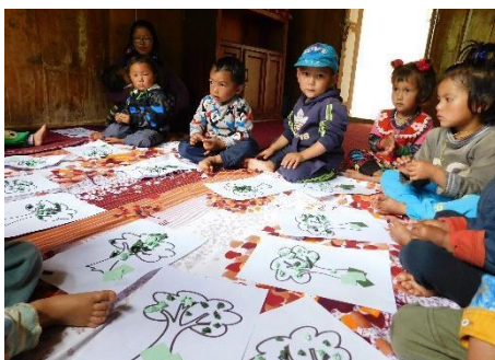
This is what the artists of tomorrow look like.

families ensure that the children are doing well and that our help gets to where it is needed.