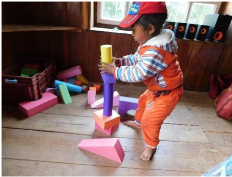
Full concentration is required here.