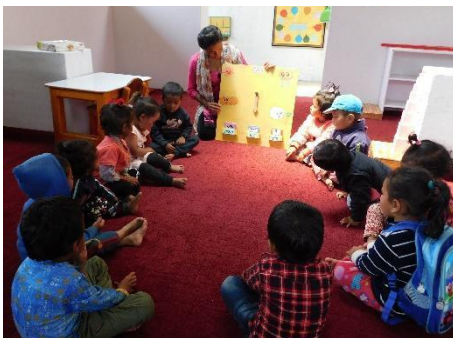
The day is discussed together.