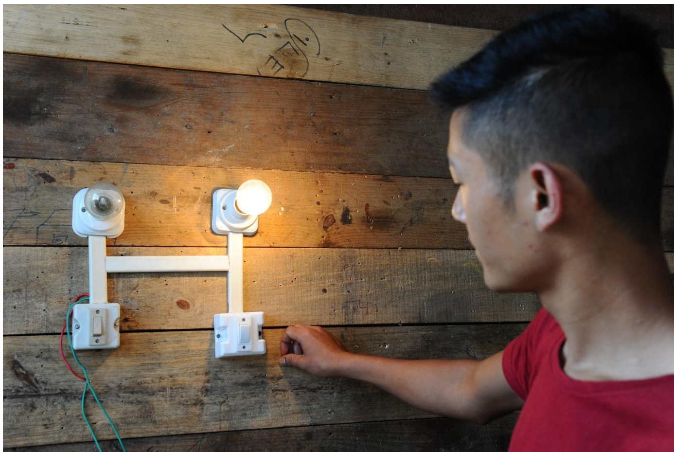
Vocational training opens up new perspectives for him. (Photo: Umsning, Meghalaya, 2019)

(Meghalaya and Assam, Northeast India, Childaid Network project progress report and outlook, February 2020)