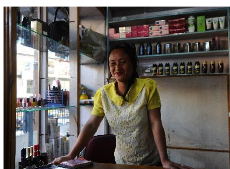
She has what many dream of - her own small company.

New perspectives are needed to help people break out of poverty: In Northeast India most people still live from agriculture. But: the land is no longer sufficient to feed the growing population, in particular when harvests fail due to the climate change. There still is a lack of other opportunities to earn money. Therefore, more and more young people migrate to the cities in the South or abroad. The rural exodus not only deprives the villages of young leaders. Torn from their cultural groups, the young people often end up in misery, because unqualified people they do not find good employment. Low paid day labor jobs are often the only way out.