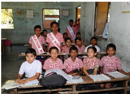
Children's parliaments are an important part of the projects.