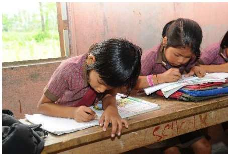
Full concentration is required here.