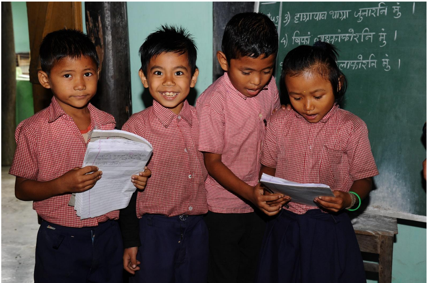
Good teaching promises a better future. (Photo: Chirang District, Assam, 2019)

(Assam, North East India, Project Progress Report, March 2020)