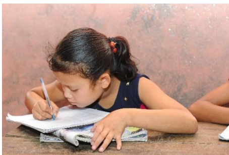
There's so much to learn.