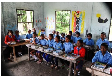
The children should be able to learn in a beautiful environment.

Poorhouse Northeast India: The seven sister states of Northeast India, together as big as the old federal states, are one of the poorest regions in the world. Hard to reach, barely developed and endangered by natural disasters and ethnic conflicts, more than half of the 45 million inhabitants live below the poverty line of one euro per day. In the mountains, four out of ten children do not live to see their fifth birthday. In our target group, more than 90% of the adults are illiterate - and even for the younger generation, good education is usually an unknown luxury.