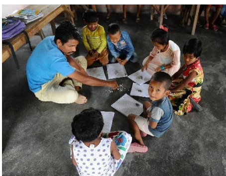
Practical learning is also the best for the little ones.

Education is a fundamental right - but learning success cannot be subscribed to: With the passing of the Right to Education Act 2009, India declared education to be a fundamental right and anchored compulsory schooling and the right to free education for all in the law. Official statistics say: 97% of children are now registered in schools. But the reality in India is different: only 87.74% of the children finish primary school with the fifth grade. Only half of the pupils in class 3 can read texts from the curriculum of class 1. They are therefore at least two years behind the curriculum and are unlikely to catch up.