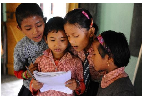
The task is completed together.

the SMCs, more than 1,000 people have been sensitised to good education.