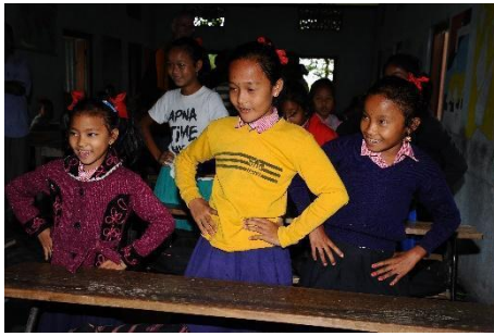
Interactive lessons are fun.