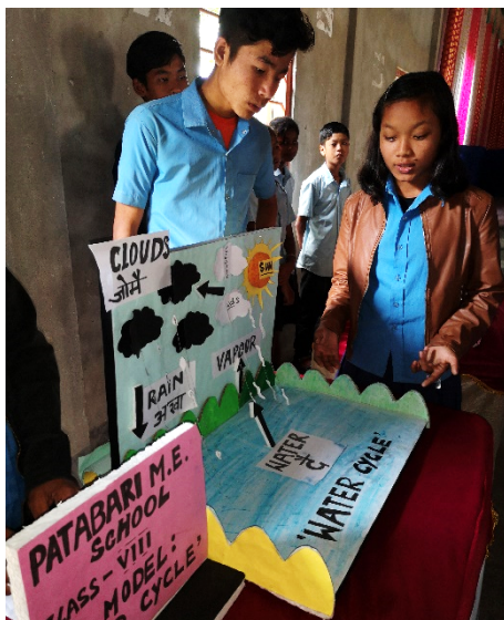
In the science exhibitions the students proudly present their work.

44,430 Family members benefit indirectly