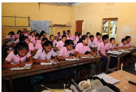
This is the place to study for your degree.

Education is a fundamental right - but learning success cannot be subscribed to: With the passing of the Right to Education Act 2009, India declared education to be a fundamental right and anchored compulsory schooling and the right to free education for all in the law. Official statistics say: 97% of children are now registered in schools. But the reality in India is different: only 87.74% of the children finish primary school with the fifth grade. Only half of the pupils in class 3 can read texts from the curriculum of class 1. They are therefore at least two years behind the curriculum and are unlikely to catch up.