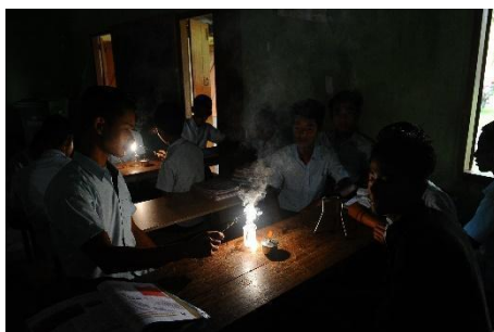
This is what really exciting lessons with practical experiments look like.