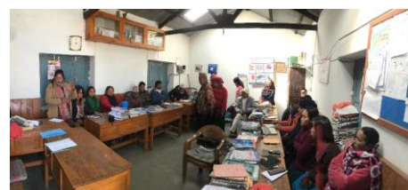
Meetings with local stakeholders are an essential part of our projects.

health and well-being of all children, young people and women in the region.