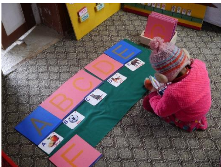
Early development promotion lays the foundation for successful learning.