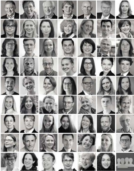
A small part of the Childaid Network core team, consisting mostly of volunteers.