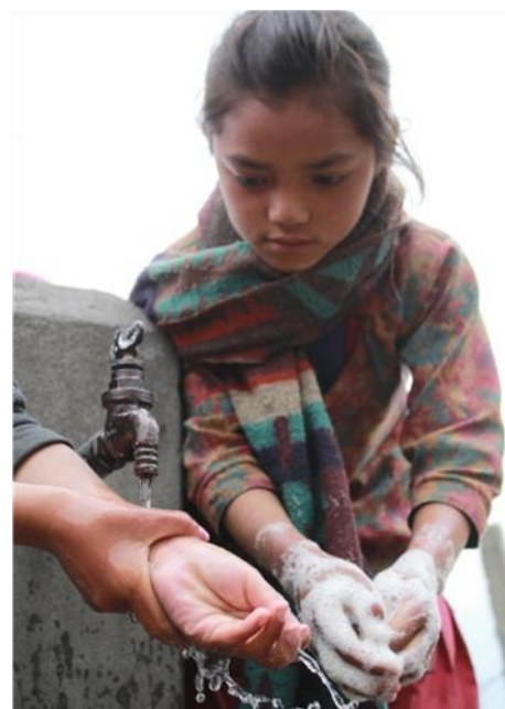
Washing your hands has to be learned as well.