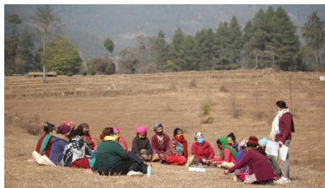
The mothers' groups provide a valuable opportunity for women to share, learn and empower themselves.