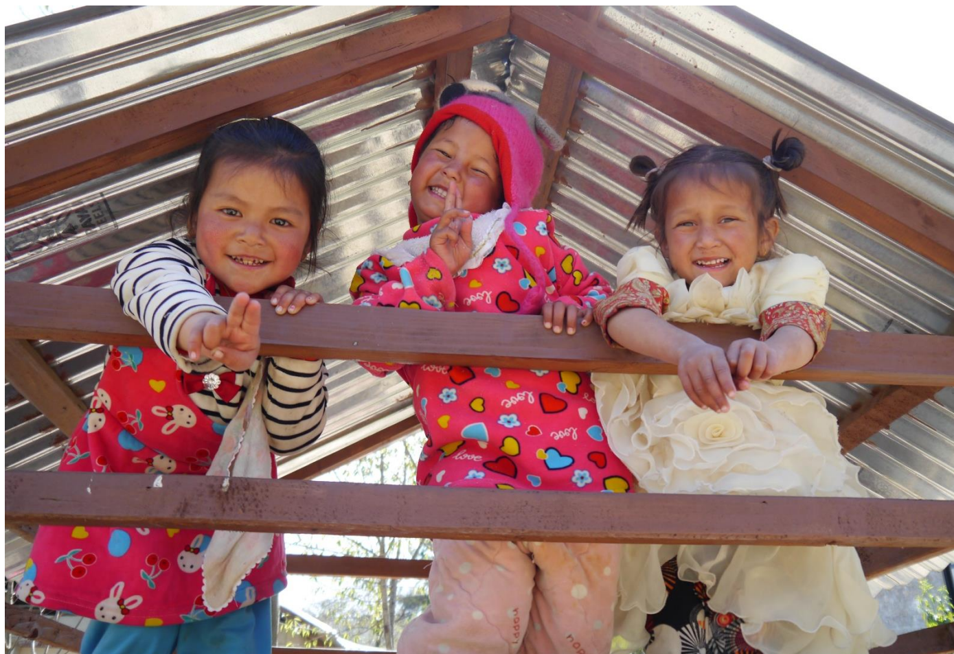
Childaid Network strives hard to build a good future for children-in-need in South-Asia.