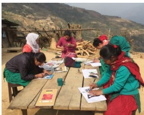
Budding seamstresses design their patterns for colourful fashion.