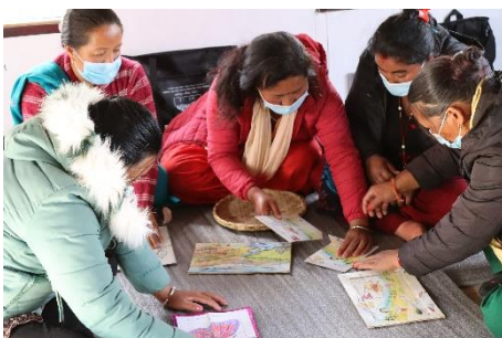
In small groups, teachers are trained in child-centered pedagogy.