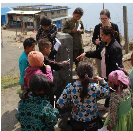
Under instruction, many children brush their teeth properly for the first time.