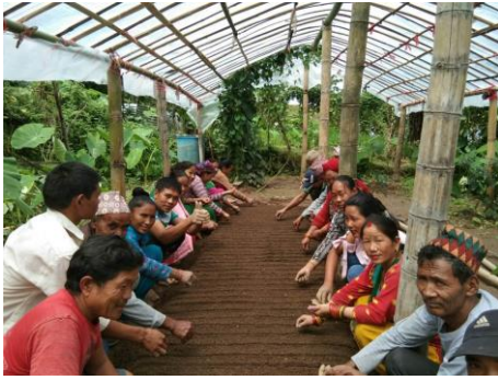
Off-season vegetable farming course.