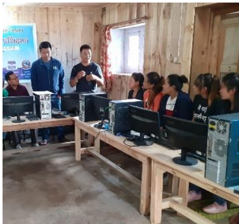
The modern training courses are popular with young men and women.