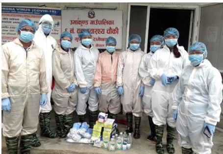
Safe during the pandemic - Equipped with PPE and trained by our partners.

In addition, the project supported schools to safely reopen, worked with 67 mothers' groups and 1,000 adolescent girls regarding menstrual hygiene. In December 2021, we extended funding and - upon request of local authorities - started a multi-year health project to strengthen resilience during the pandemic with training and awareness raising and to promote sustainable health promotion also in the Umakunda and Gokulganga districts. Similar health promotion projects in neighboring rural municipalities are needed and part of our planning.