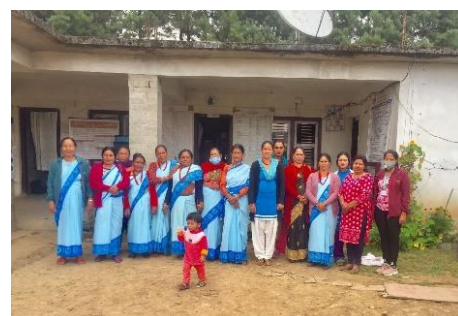
The FCHVs are the central pillars of the health system.