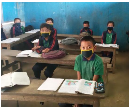
Thanks to equipment and awareness raising, schools are now safe.