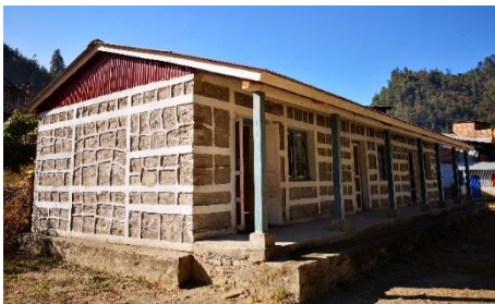
Rebuilt after the earthquake – solid and earthquake proof.